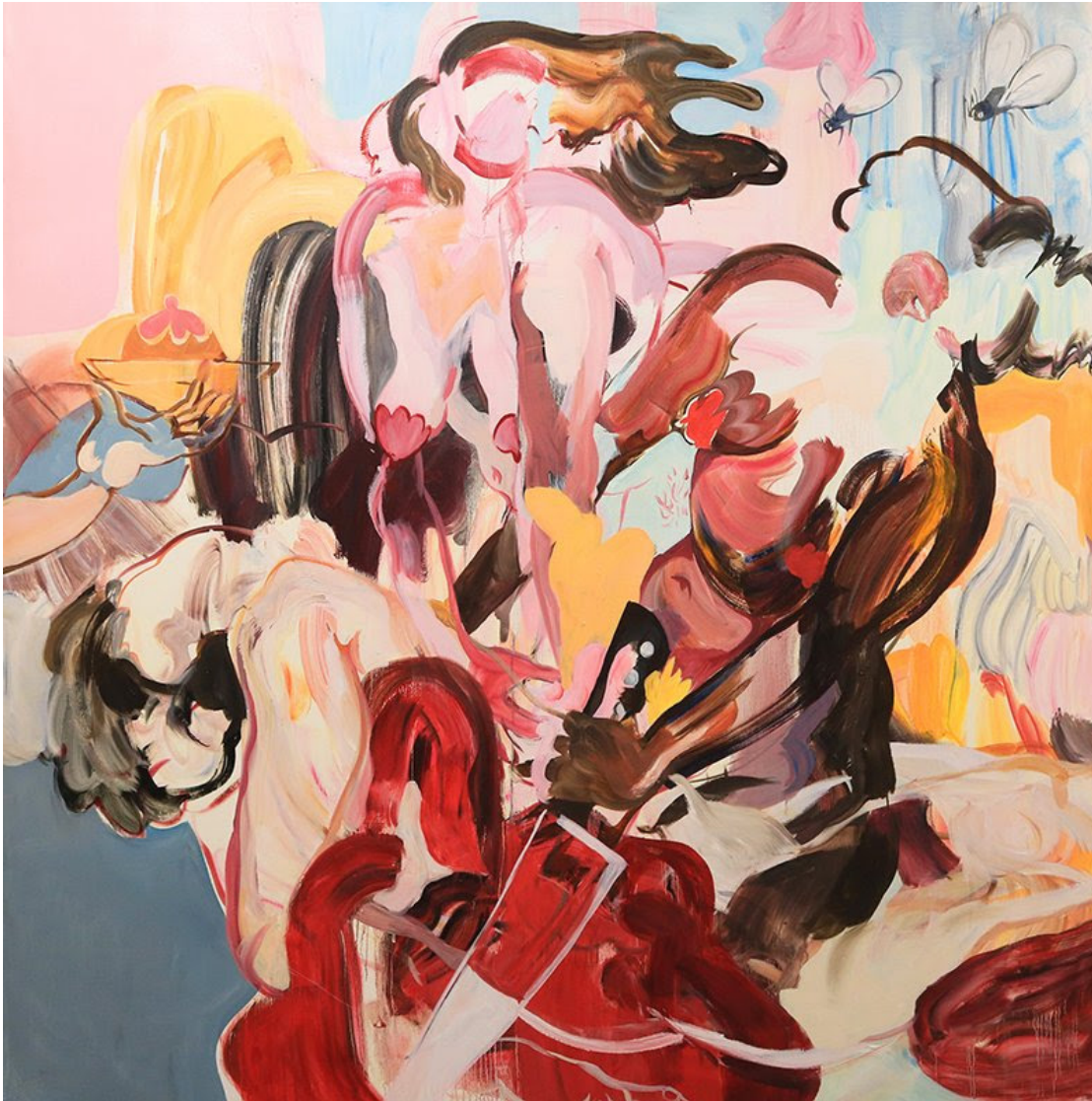
Wynnie Mynerva, Story of Revenge (2021).