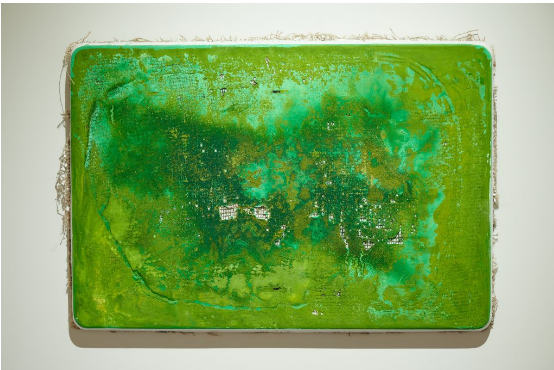
William Eric Brown, ColorStatic #3 (2020).