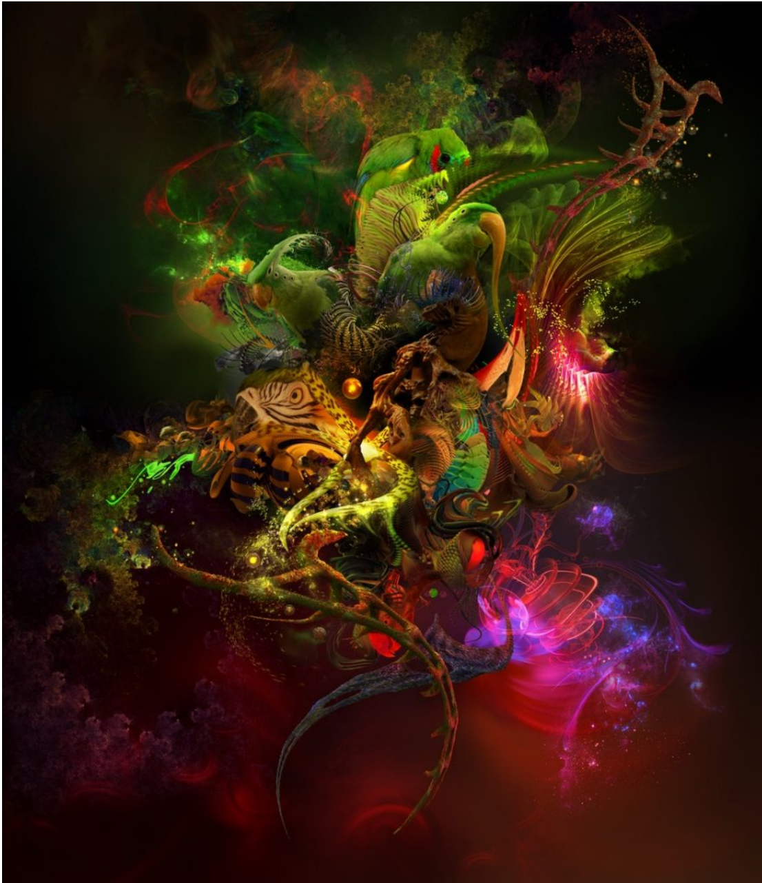
Andy Thomas, Abstract Parrot 2 .