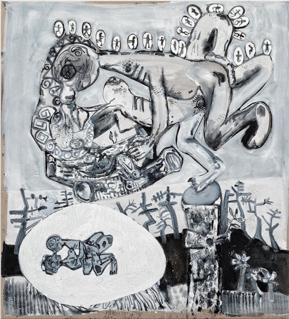
Tobias Pils, Coupling 1 , 2020, mixed media on canvas, 2.2 × 2 m

This made me think about my own practice – how I conceive ideas and how they develop. When I paint something new, the mark that has come from my hand or my mind demands that I study it, that I analyse and try to understand it. Then finally, perhaps, I can make use of it. This process brings me closer to my thoughts and putting all of this into my work helps to create more layers and more possibilities.