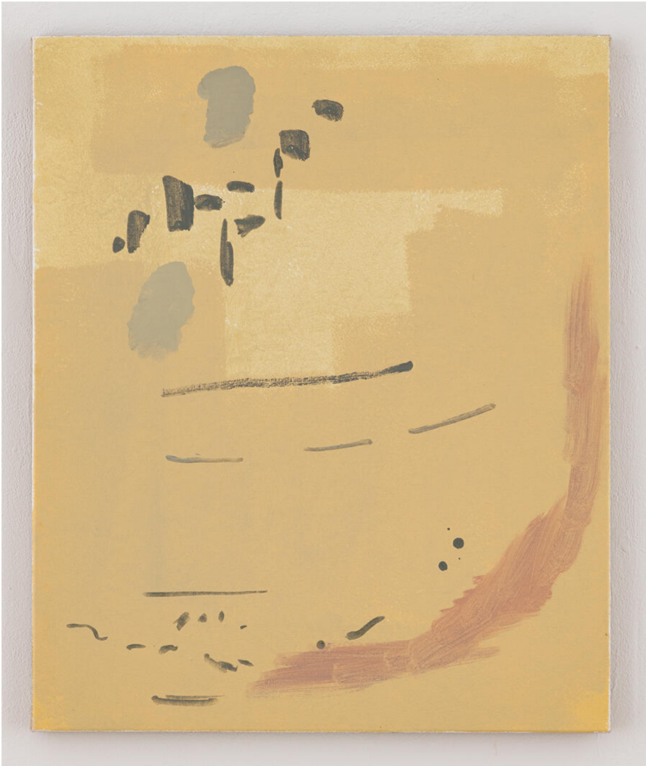
Michael Krebber, KAN IN CHEN 15 , 2020, acrylic on linen, 60 × 50 cm