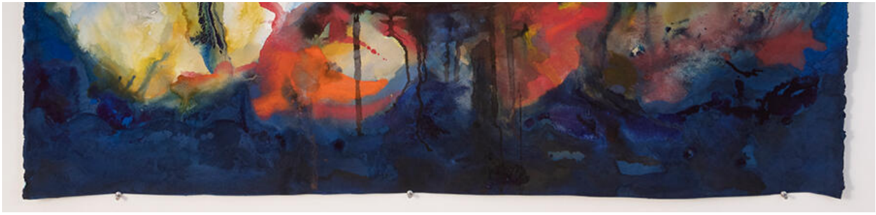
Shahzia Sikander, Sub Blues , 2019–20, ink and gouache on paper, 2.5 × 1.3 m