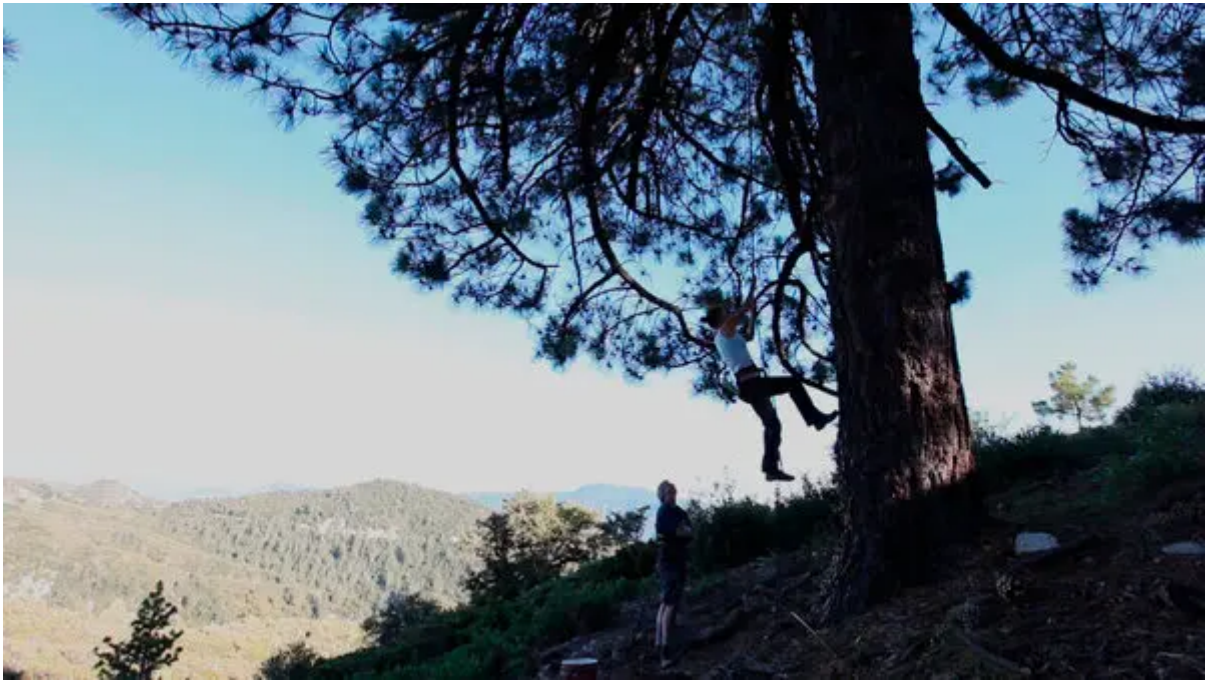
Film still from Andrea Bowers's "Nonviolent Civil Disobedience Training — Tree Sitting Forest Defense" (2009), in which the artist learned the technique of tree-sitting from a veteran activist.