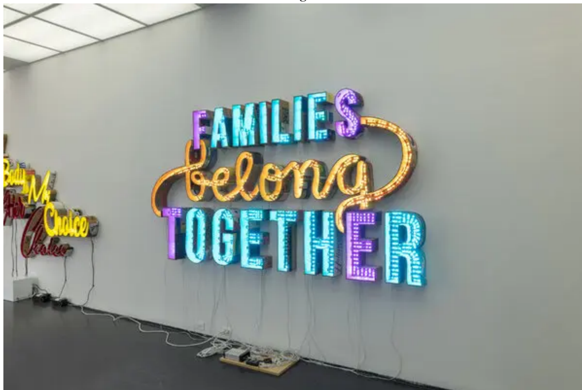
Installation view of “Families Belong Together” (2018), advocating immigration reform, one of a series of neon works that employ protest slogans.

“She approaches the question of what is art’s role in addressing political and cultural issues as a distinct practice,” said the conceptual artist Charles Gaines , her friend and former teacher at CalArts.