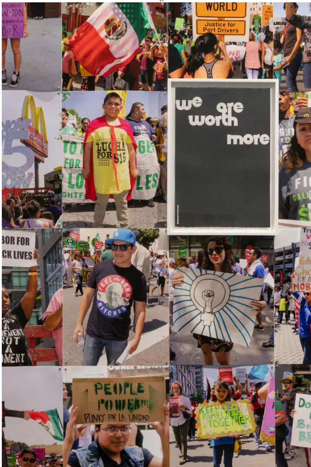
At MCA Chicago, installation of photographs taken by Bowers at protests around the country.