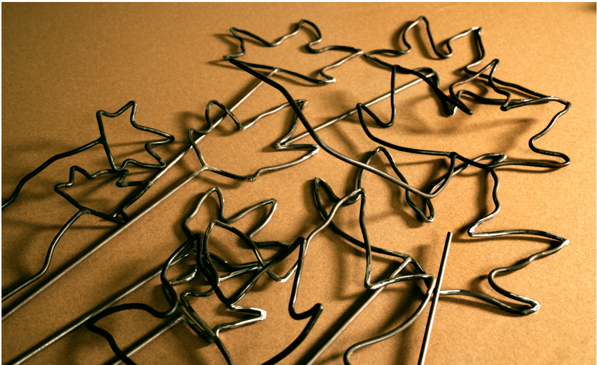
Work in progress on the neon leaves