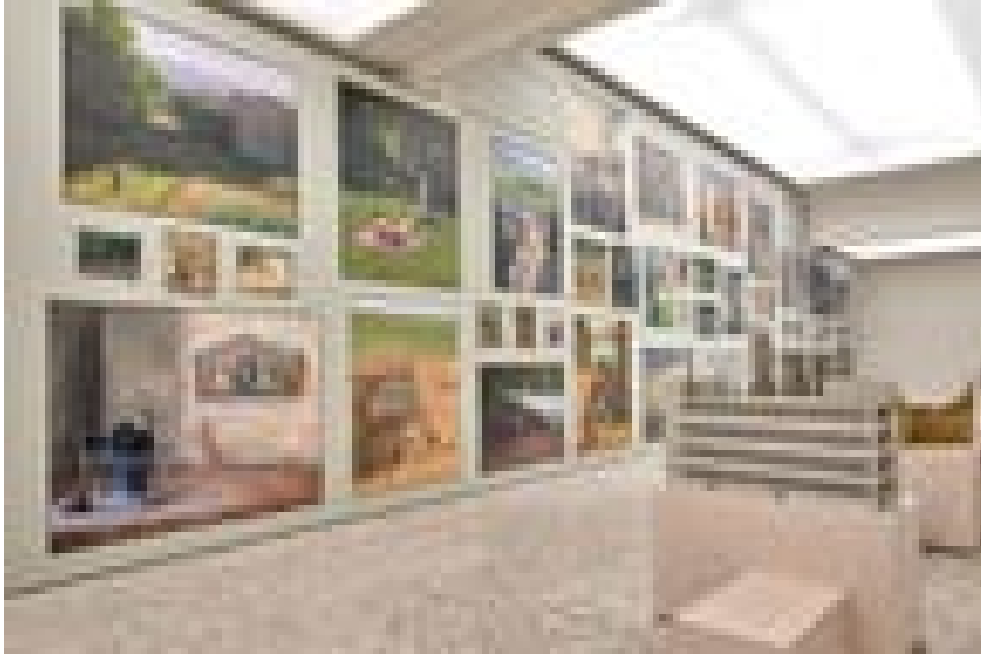
Romanian Pavilion, Giardini

At the Romanian Pavilion, Șerban Savu's "What Work Is" delves into the dichotomy of labor and leisure through a series of deeply humanistic paintings. Savu captures serene moments of daily life, often showing individuals in reflective postures against backdrops that suggest a pause in their routine.