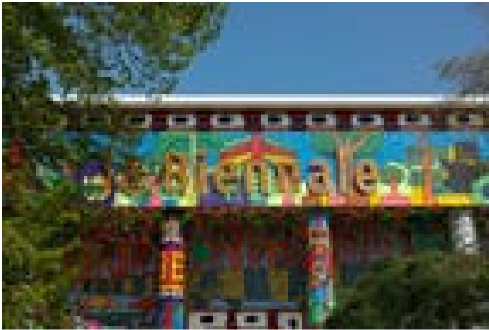
Central Pavilion La Biennale Arte 2024, mural painted by indigenous Amazonian artists Movement dos ... [+]

central pavilion at Giardini, painted by a group of indigenous Amazonian artists “Movement dos Artistas Uni Kuin.”