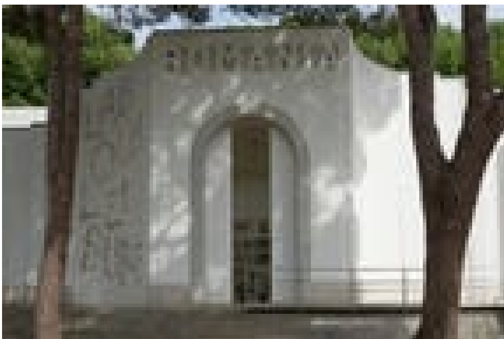
Romanian Pavilion, Giardini, Biennale Venice 2024

At the Romanian Pavilion, Șerban Savu's "What Work Is" delves into the dichotomy of labor and leisure through a series of deeply humanistic paintings. Savu captures serene moments of daily life, often showing individuals in reflective postures against backdrops that suggest a pause in their routine.