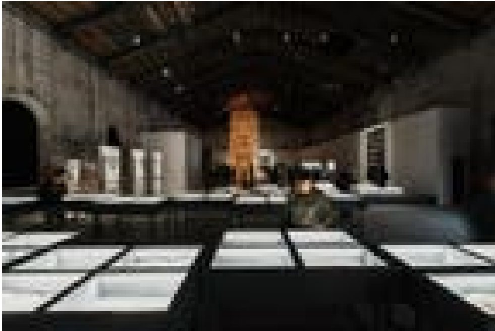
China Pavilion, Arsenale, Biennale Venice 2024 Ministry of Culture and Tourism CHINA

The China Pavilion, under the theme "Atlas: Harmony in Diversity," elegantly navigates the continuum between ancient Chinese art traditions and contemporary artistic expressions. This exhibition is split into "Collect" and "Translate" segments, featuring a digital archive of historic artworks alongside modern pieces that draw inspiration from these artifacts. The juxtaposition fosters a dialogue that not only spans ages but also highlights the universal themes of harmony and cultural continuity.