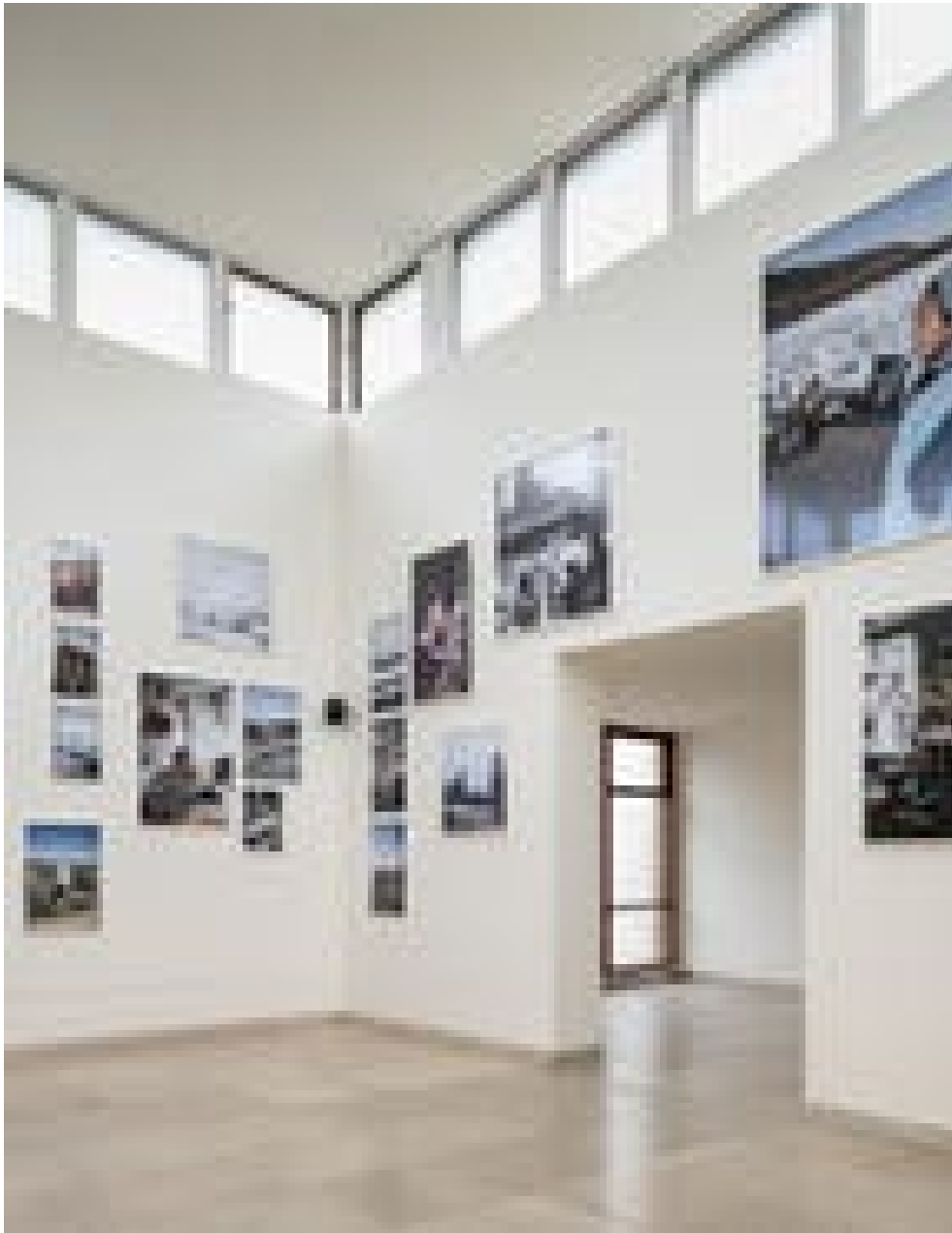
Danish Pavilion, Venice Biennale Arte 2024, Giardini