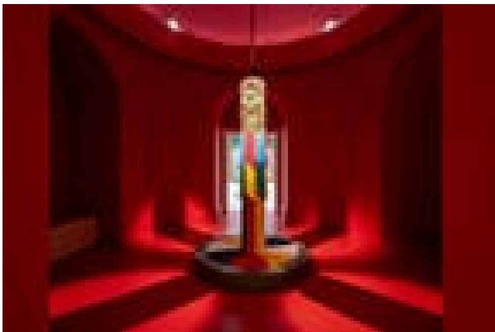
US Pavilion, Giardini, Venice Biennale 2024