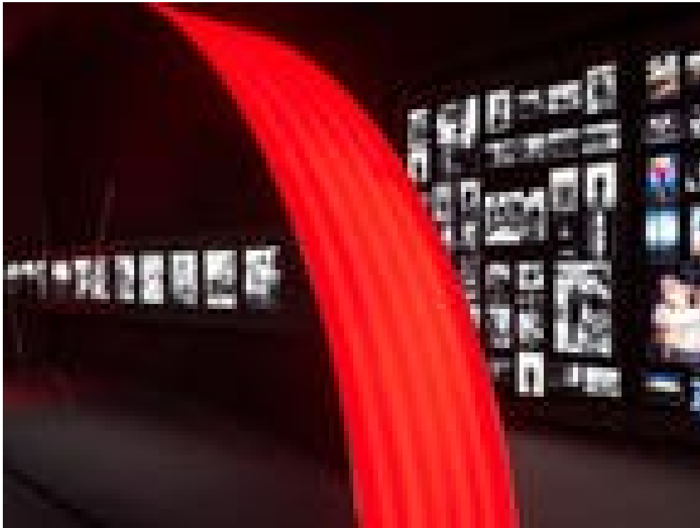
Danish Pavilion, Giardini