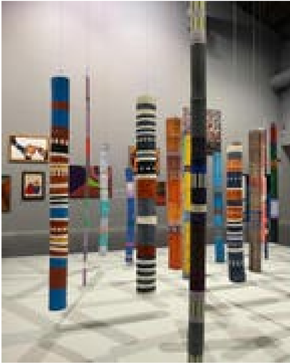
Main hall of La Biennale's Central Pavilion.