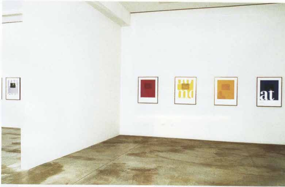
Two views of Prina's installation What's wrong? Open the door! What's wrong? Open the door!... I was scared.... , 1996, Ilfochrome print on vinyl computer film, 35 prints total, 31½ by 24½ inches each, at Lohring Augustine, New York.

PRINA I first used that gesture in three "Push Comes To Love" exhibitions, in 1999, which each included 15 framed photo-and-text panels, five monochrome paintings and a series of small photographs. The sprayed dot is grounded in the conceit that after I installed these meticulous works, which had been produced elsewhere, something felt missing. Curiously, this seeming marker of presentness becomes a trace from the past as soon as the last fume is expelled from the can.