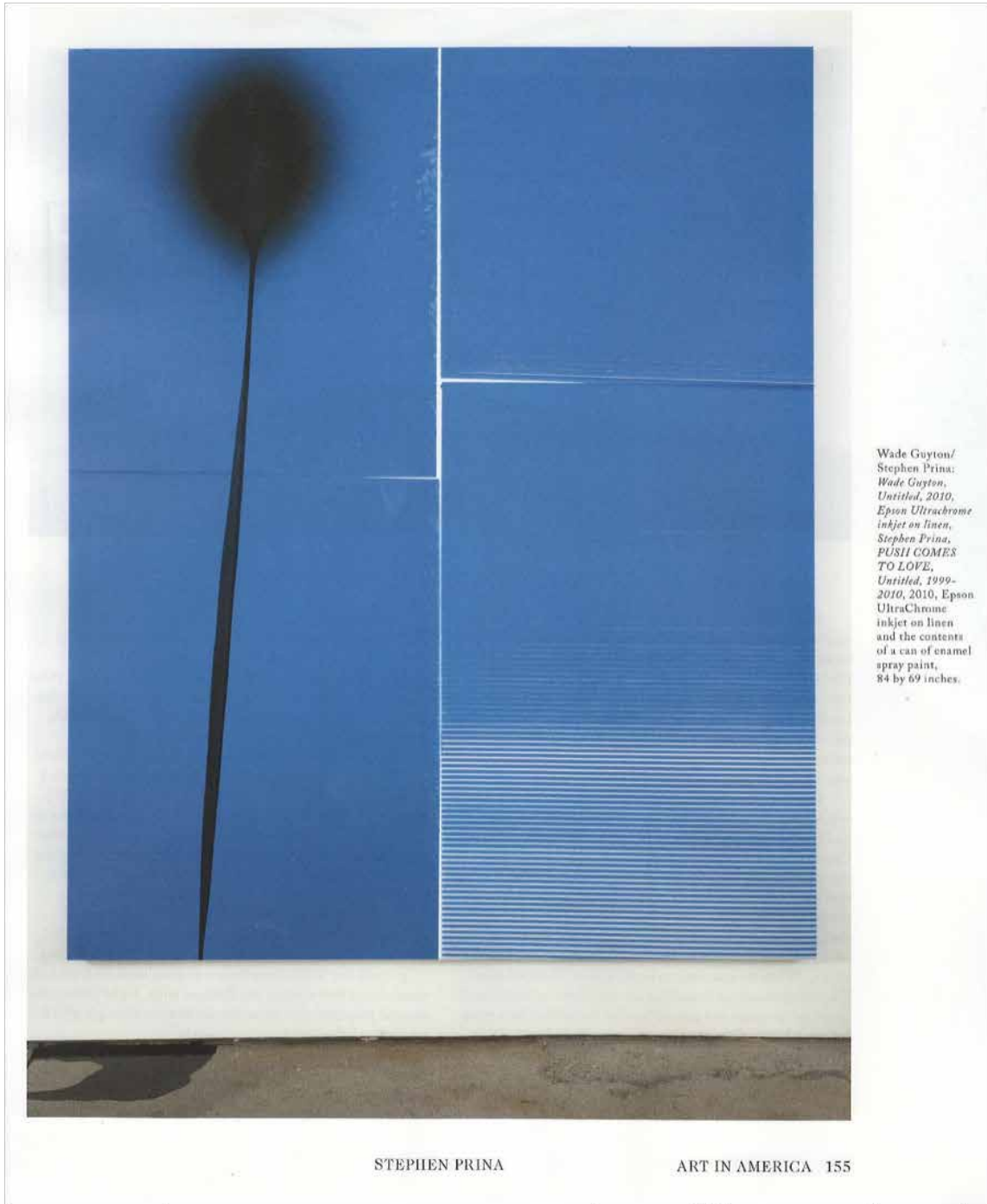
Wade Guyton/ Stephen Prina: Wade Guyton, Untitled, 2010, Epson Ultrachrome inkjet on linen, Stephen Prina, PUSH COMES TO LOVE, Untitled, 1999- 2010, 2010, Epson UltraChrome inkjet on linen and the contents of a can of enamel spray paint, 84 by 69 inches.