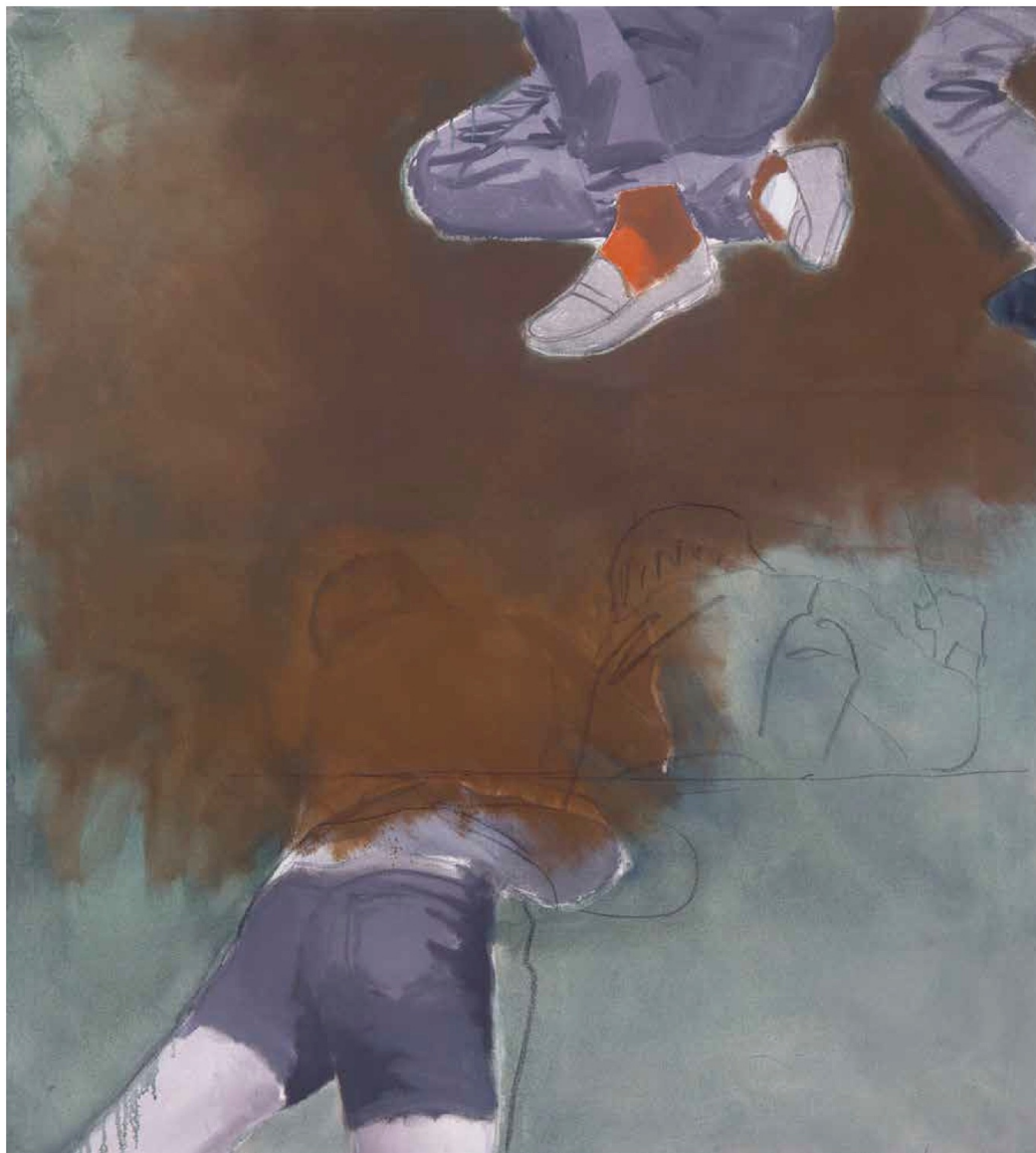
Floorpiece, 2013. Courtesy: the artist; Petzel, New York.