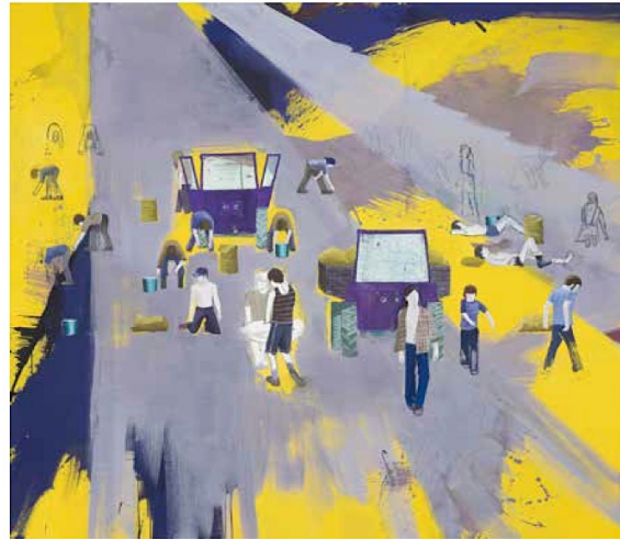
Yellow Harvest , 2012. © The artist. Courtesy: Maureen Paley, London