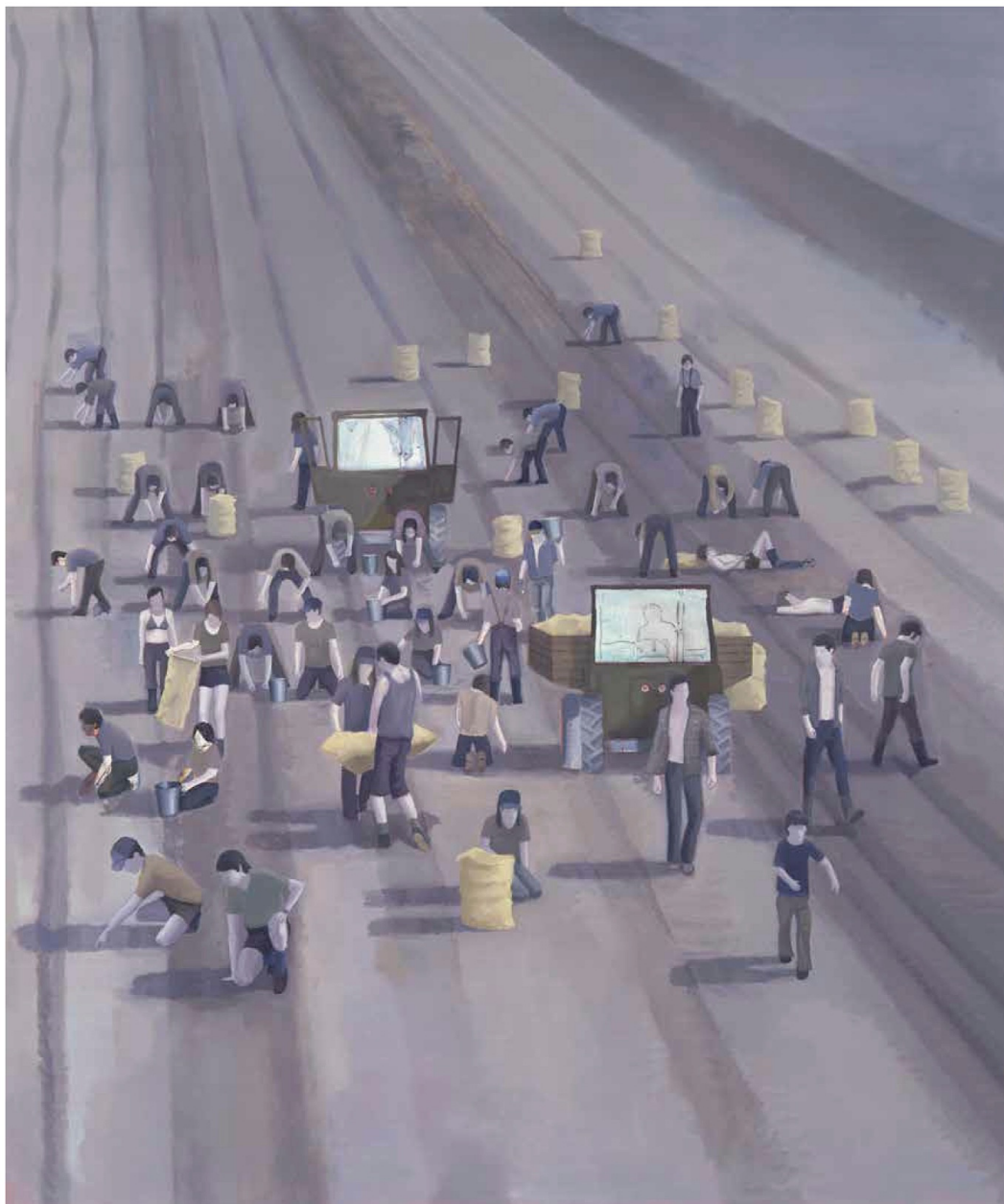
Grey Harvest, 2013. Courtesy: the artist, Petzel, New York.