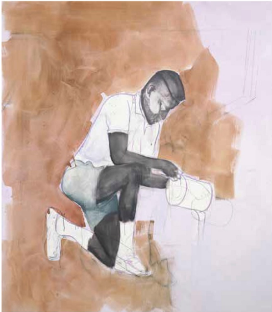
Recycler , 2013.

absorbing the pressures of their surroundings with folding limbs. Blending into the ground: survival and camouflage. I think of Valie Export's Body Configurations . Sitting down as a gesture of negation and refusal, of not being available, demanding repose, of stepping out of the gestural canon. There is of course also the aspect of animalistic fun, kneeling in the mud, enjoying encounters with liquid, entropic masses. That is in part why I often paint children or teenagers. The anarchic sexuality of childhood is not yet converted into the regulated economy of grownup desire.