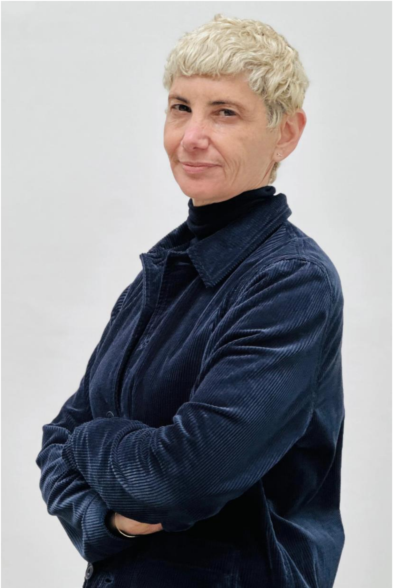
Portrait of Yael Bartana, 2024.