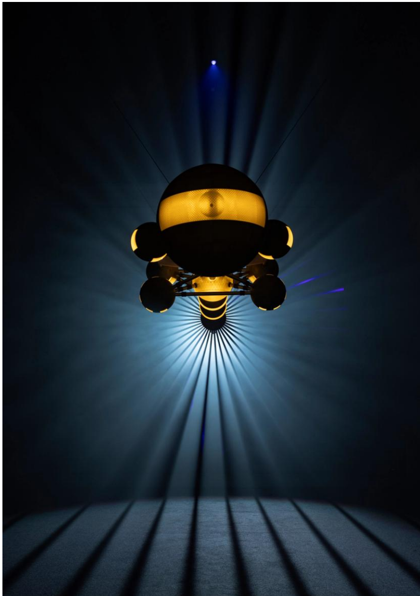
Yael Bartana, Light to the Nations , 2022–24. Installation view, German Pavilion, 60th International Art Exhibition – La Biennale di Venezia, 2024.

YB: I'm actually very curious about how the audience will continue to read my proposition. I've found that every presentation, both before and after 7 October, has evoked a whole array of experiences and reactions from people.