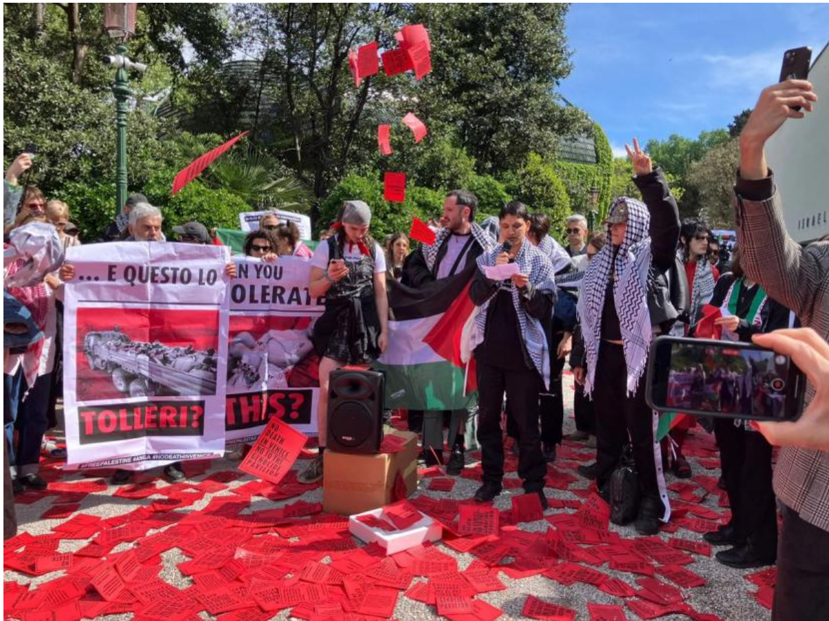
Protest organized by the Art Not Genocide Alliance during the opening of the 60th International Art Exhibition – La Biennale di Venezia, 2024

YB: People should make statements! At the same time, I am wary of attacks on individual artists. There can be no question that Hamas does not represent all Palestinians, just as the state of Israel, particularly its current government, does not represent all Israelis. I think it's important that we keep differentiating between states and citizens on both sides.