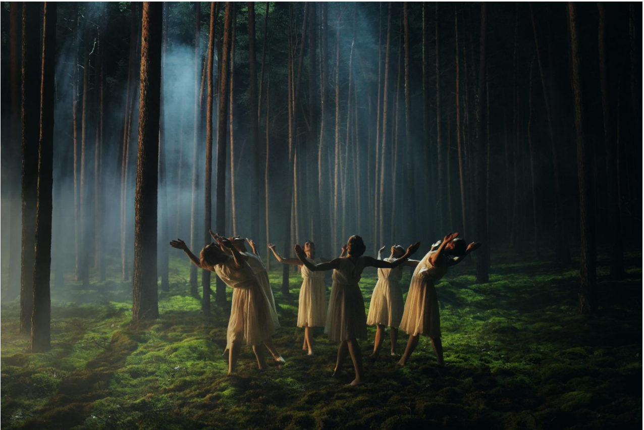
Stills from Yael Bartana, Farewell , 2024, single-channel video, 15:20 min., as part of Light To The Nations , 2022–24.