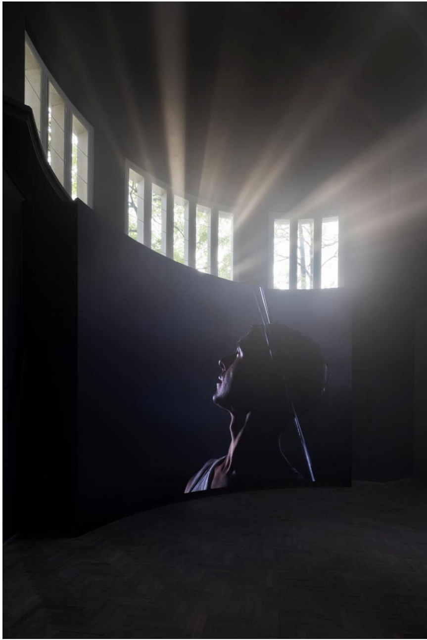
Yael Bartana, Light to the Nations , 2022–24. Installation view, German Pavilion, 60th International Art Exhibition – La Biennale di Venezia, 2024.