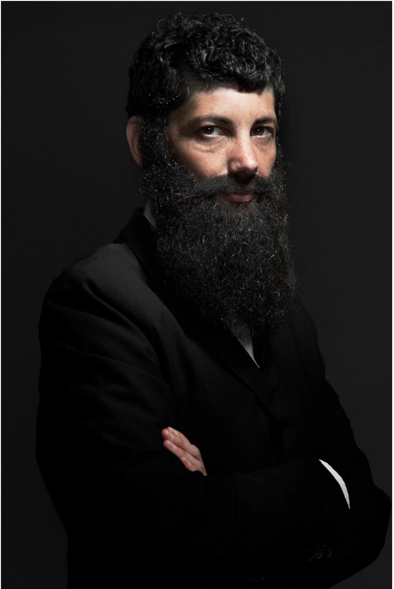
Yael Bartana, Herzl III , 2015, photo series of six images.