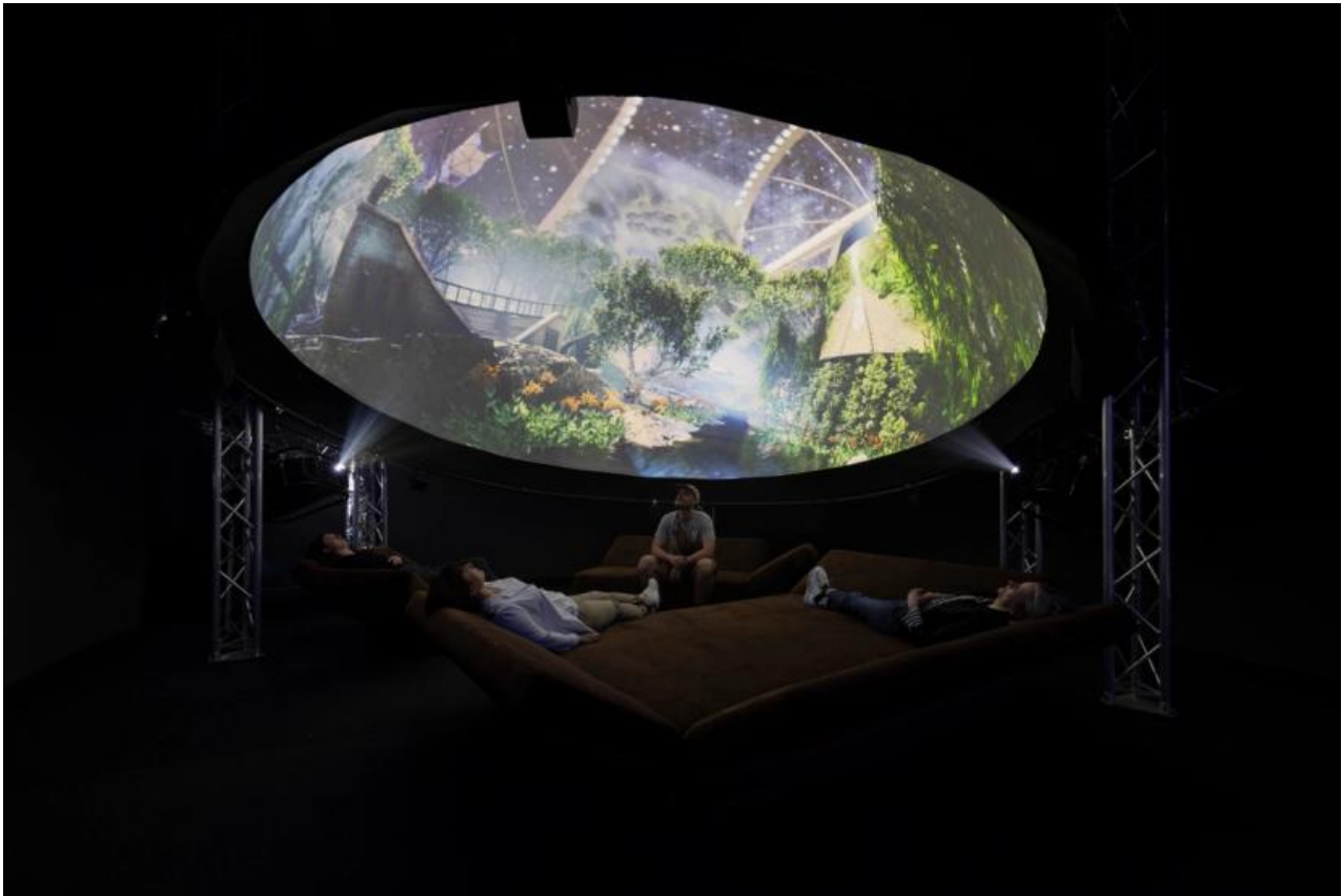
Yael Bartana, Light to the Nations , 2022–24. Installation view, German Pavilion, 60th International Art Exhibition – La Biennale di Venezia, 2024.

HaH: What do you make of the cancellations, restrictions, and even travel bans that numerous individuals in Germany’s cultural sector have faced for their criticisms of Israel, specifically its incursions on Gaza and the dozens of thousands of Palestinians killed in this process?