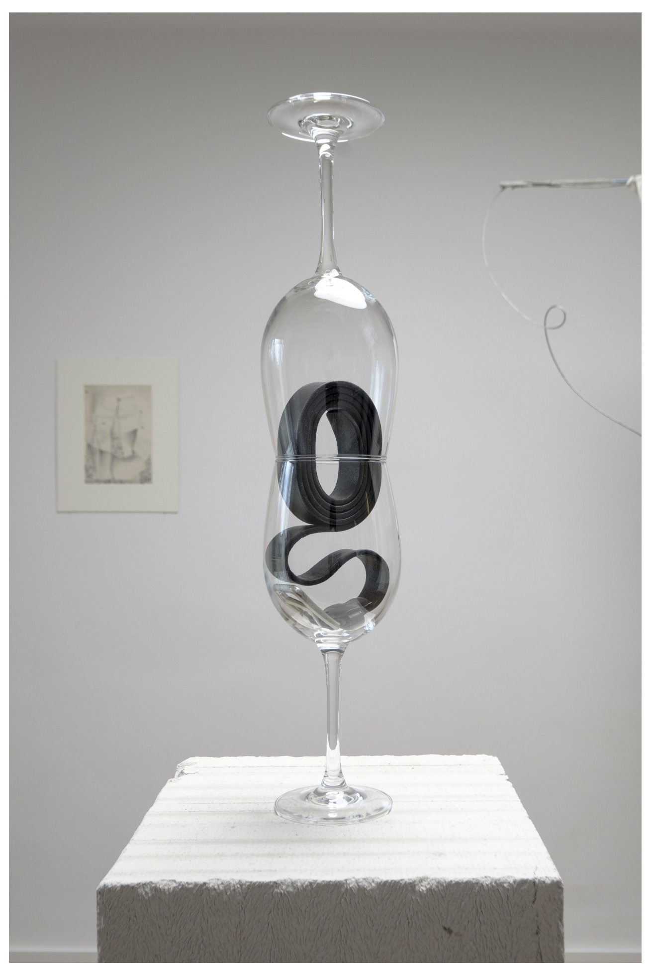
Mutual Debt, 2022, Wineglasses, Leather belt. 49 x 9 x 9cm