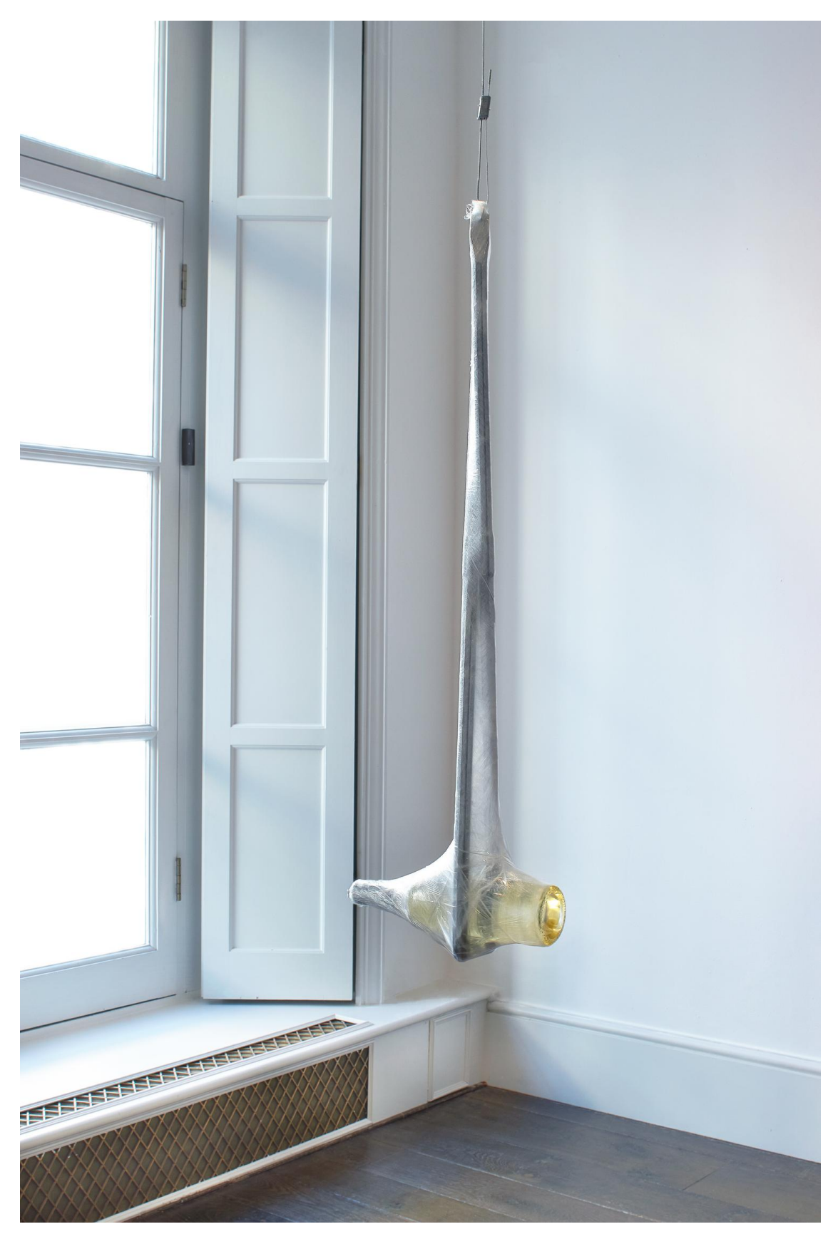
Said something, 2022, Wine bottle, Shrink-wrap, Crowbars. 30 x 14 x 110cm

You mentioned there are 'bigger questions' you are interested in exploring, what may they be?